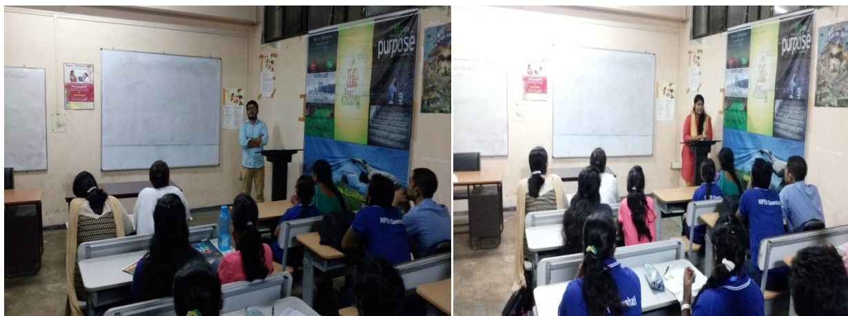
Students at the Elocution Competition

The students, staff and the faculty members of NIPER-Guwahati took active part in the week long Vigilance Awareness Week from 31 st October – 5 th November 2016. The theme of the Vigilance Awareness Week this year was “Public participation in promoting Integrity and eradicating Corruption”. Stress has been laid in curbing corruption which is a serious unethical practice that undermines trust and confidence in public officials and public confidence, which can only be gained by integrity in governance. A Pledge taking ceremony was organized on 3 rd November 2016 to mark the occasion. All the faculty members, staff and students participated in the bi-lingual pledge ceremony. Competitions such as elocution, essay writing etc. were conducted and prizes were awarded to the winners of the various competitions. The students as well as the faculty and staff were delighted to be part of this great initiative. NIPER-Guwahati looks forward to such wonderful initiatives for curbing corruption from our Country.